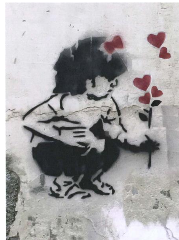
unknown artist, Graffiti seen in Rome 2016

Congestive heart failure in congenital heart diseases, from fetus to adult